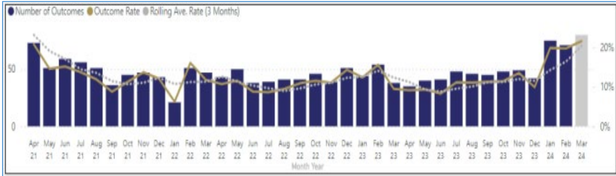
• Figure 2 – Violence without Injury 'action taken' outcome rates.