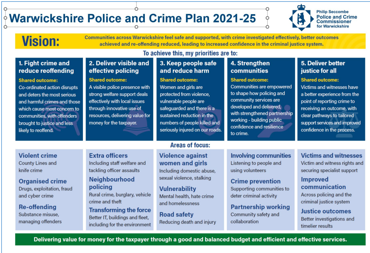
Figure 1 – Police and Crime Plan 2021-25 ‘Plan on a Page’.

In terms of the PCC responsibilities to ‘hold to account’ the Chief Constable for the performance of Warwickshire Police, the PCC holds a formal monthly ‘Governance and Performance Board’ (GPB) meeting with the Chief Constable. The purpose of the GPB is to focus on specific areas of force performance and is attended by senior officers and staff from the force and the Office of the Police and Crime Commissioner (OPCC). The minutes of the meetings are published on the OPCC website. At each GPB a topical ‘Focus subject’ of particular interest is selected for in-depth scrutiny and discussion.