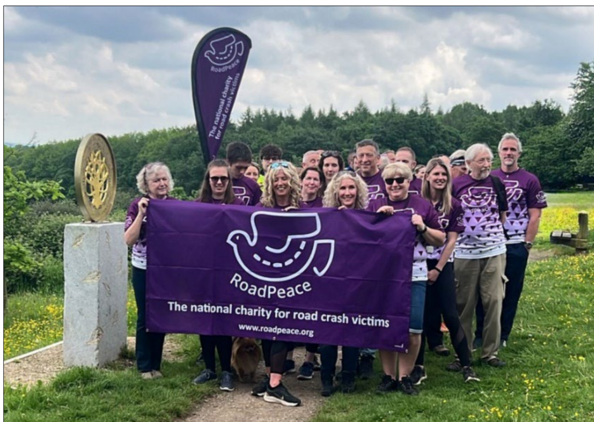
Figure 1: Road Peace at Hartshill Hays

On 17 May 2024, Global Road Safety Week commenced, designed to help improve road safety across the county for all road users. Both Warwickshire Police and the OPCC participated in the event with a wide range of road safety activities centred on education and enforcement. As part of this campaign, a special event took place at Hartshill Hayes Country Park with representatives from several road safety partnerships, road safety campaigners, Project Edward, and the British Horse Society.