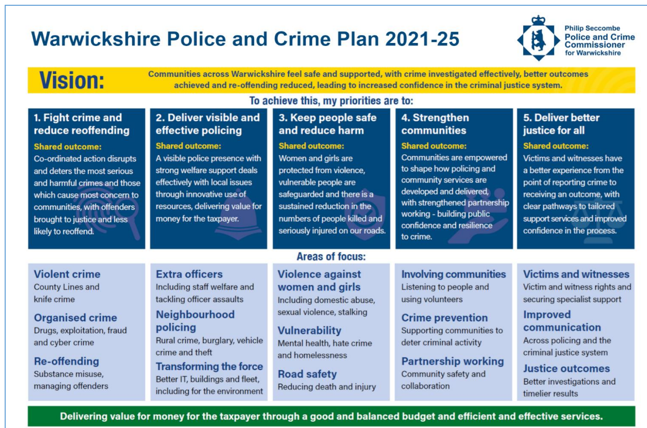
Diagram 1 – Police and Crime Plan on a page

Performance against the priorities identified in the Police and Crime Plan are monitored through the performance framework and are reported regularly to the Police and Crime Panel, and in the PCC’s Annual Report. The accomplishment of these objectives will be through continued effective partnership working at all levels, not just with the force as its key partner, but also by working closely with local authorities and Community Safety Partnerships (CSPs), other key local, regional and national stakeholders and partnerships.