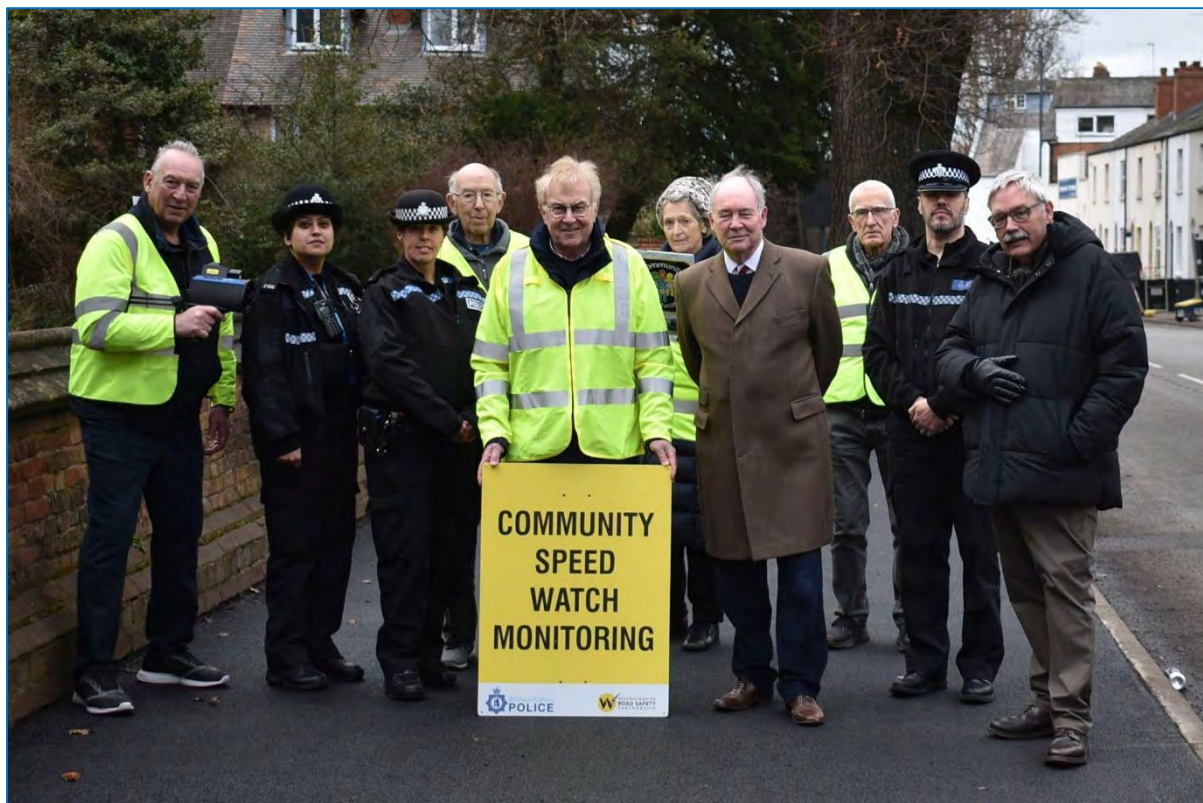
Figure 6: Joining police and volunteers at the launch of a new Community Speed Watch scheme in Milverton.

I continue to be a passionate supporter of Community Speed Watch, which enables communities to help themselves. There are now nearly 70 groups around the County with over 600 volunteers helping to make Warwickshire roads safety by deterring excess speed.