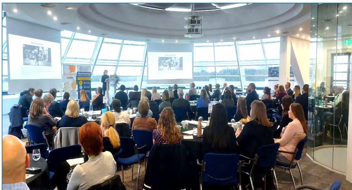
Figure 7: The 'Big Conversation' Conference

In October 2022, the Safer Warwickshire Partnership Board 'Big Conversation' conference was held at the British Motor Museum at Gaydon. My OPCC Engagement and Communications Officer worked alongside County Council colleagues to organise the event and bring it to a reality.