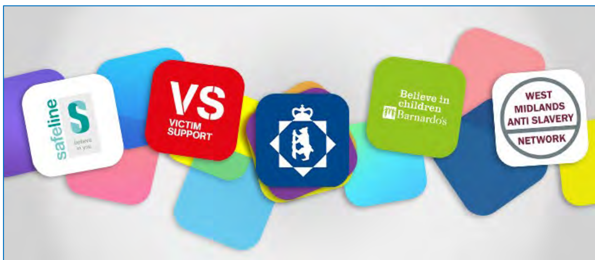
Figure 8: Four organisations were successfully awarded the OPCC's commissioned services

Whilst the current commissioned services have continued in 2022/23 to support thousands of victims, much work has also been undertaken throughout the year to prepare for the recommissioning of some of these services from April 2023, to ensure that they remain fit for purpose, meet victims needs and support the objectives of my Police and Crime Plan.