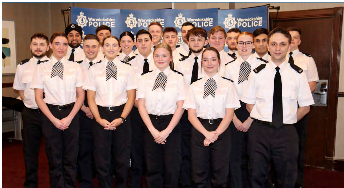
Figure 3: Some of the new police officers recruited in 2022/23

This has been a huge achievement and is among the largest – if not the largest – percentage increases in officer numbers seen by any force in England and Wales.