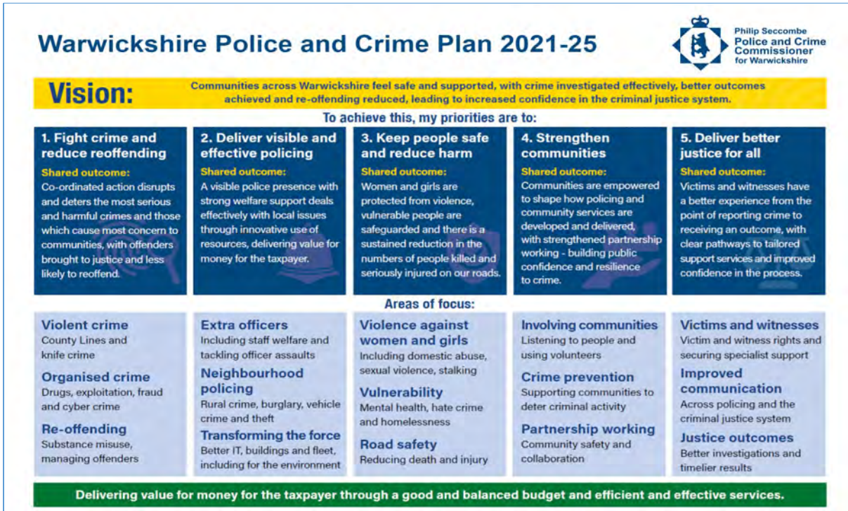
Figure 2: Police and Crime Plan 2021-2025 - Plan on a Page

This was the second year of delivering on its ambitions and a summary of the activities undertaken in support of the objectives of its priorities and focus areas are as follows: -