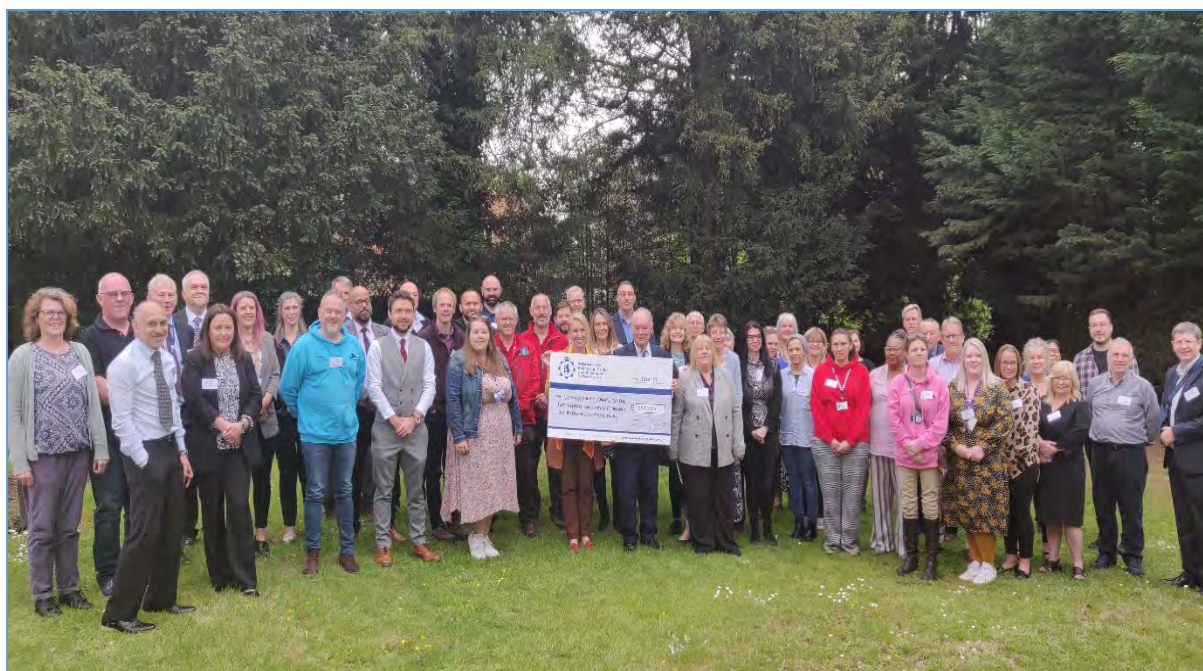
Figure 13: Recipients of the Police and Crime Commissioner's Grants Scheme

On 5 December 2022, my office launched the Commissioner's Grants Scheme for 2023/24 to support the five main objectives of my Police and Crime Plan, with the two overarching themes of 'prevention' and 'diversion'. We received almost 70 grant applications in total against a total budget of £510,000, split across three funding pots - small grants, road safety and community safety partnerships. The comprehensive evaluation and due diligence processes have now been completed and the awards made.