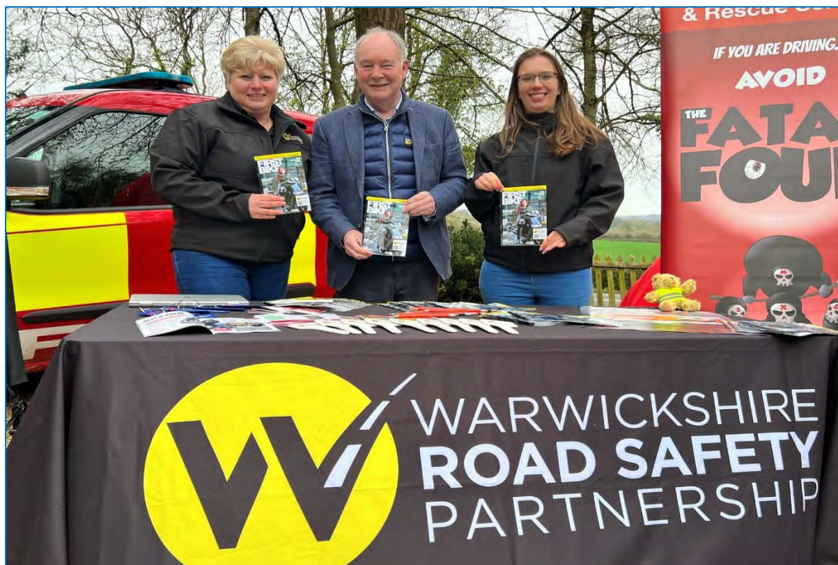
Figure 5: The Commissioner at a Warwickshire Road Safety Partnership engagement event