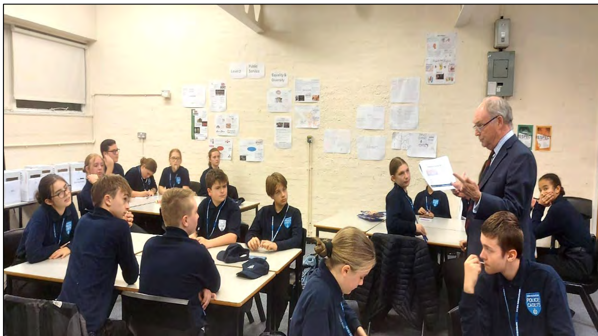
Figure 11: Warwickshire Police Junior Cadets at the budget setting exercise