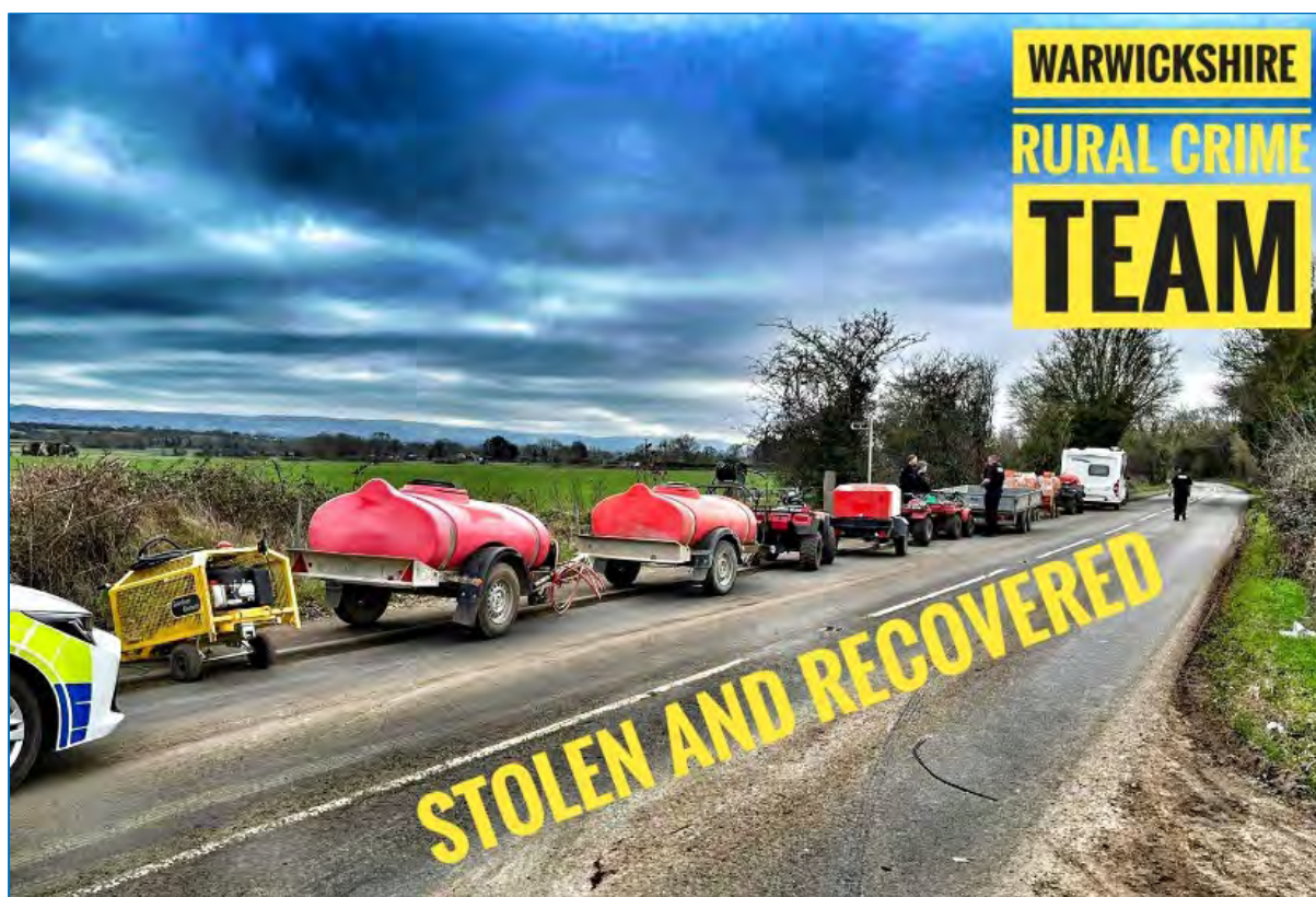
Figure 4: The Rural Crime Team recovered £150k of stolen plant equipment.