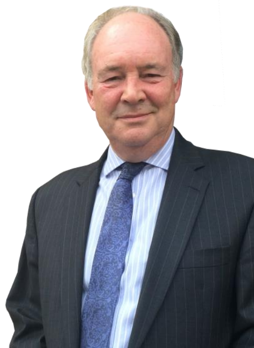
Warwickshire Police and Crime Commissioner Philip Seccombe

This will enable me to both meet current commitments and fund new initiatives and investments without increasing the Police Precept.