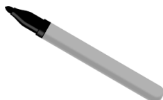
Permanent pen marking