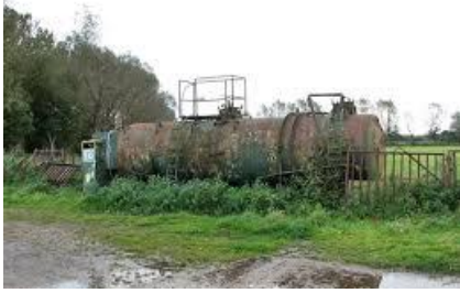
Fuel and diesel