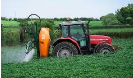
Fertilisers and pesticides

Farm equipment, tools and gadgets that have security markings on are harder for a burglar to resell and easier to return to you if found. You may want to use :